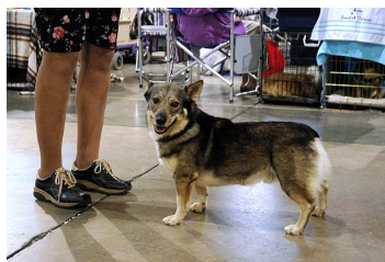
Starvon Go Ballistic