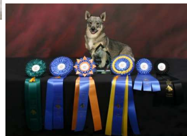
Promise and her ribbons