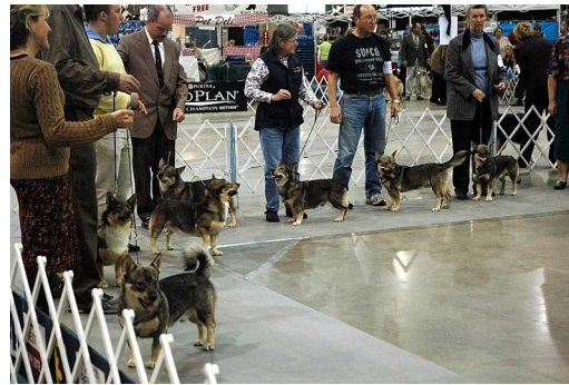
Part of the Open Dogs Class at the Friday show in Tulsa