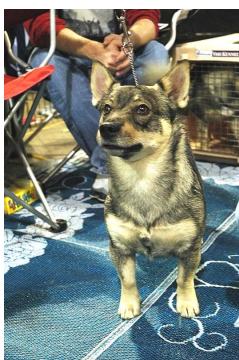
Skyview's Crimson Hawk