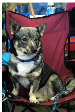
Osaflin Blaze To Glory