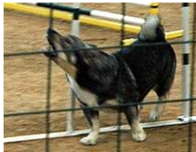
Osafin Blaze to Glory has an opinion about weave poles!