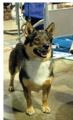
Nycalo Apollo Thor Singleton